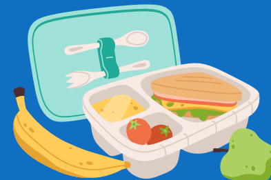
Morning Tea & Lunch