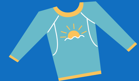
Sun Safe Clothing